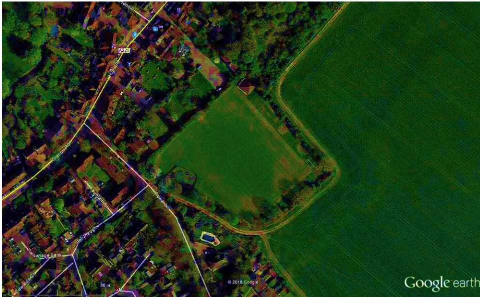
Arial View of Harrow Meadow