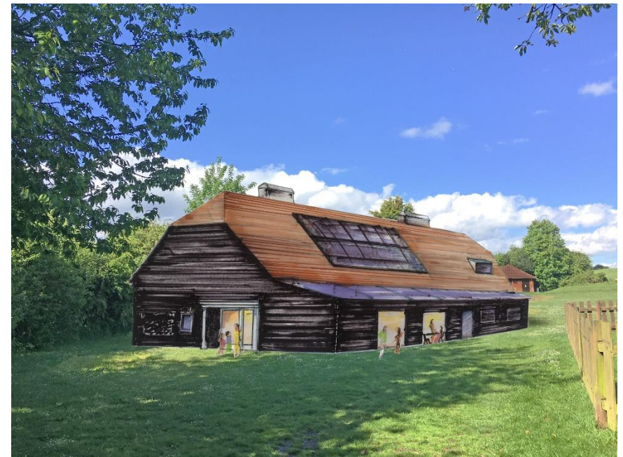
Artist's impression of the new village hall at Harrow Meadow.

The final design incorporated the comments made by the user survey.