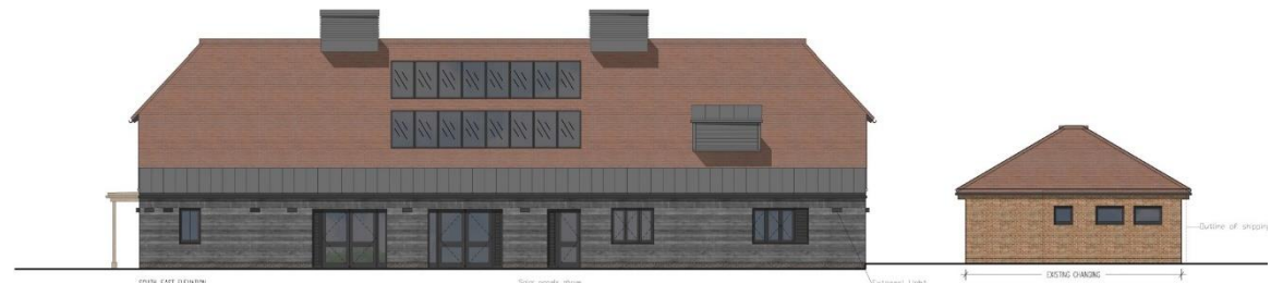
New hall next to the existing changing rooms viewed from the football pitch

The Trustees have established a project committee to manage the rebuilding process and a fundraising committee to seek the funds needed to carry through the project. The committee is supported by a practice of architects who have wide experience of building new village halls in Kent. A local appeal for funds has been launched and approaches to other sources and grant giving organisations have commenced.