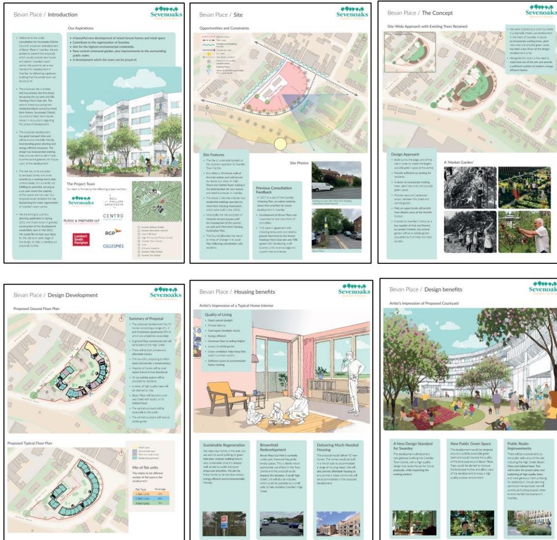
Figure B3 - Example of the consultation boards

7. At the consultation events, attendees had the opportunity to discuss the proposed scheme with members of the project team, consisting of Council officers and project consultants. Attendees were invited to attach comments to the consultation board (see figure B4) and were also encouraged to submit a questionnaire through an on-line portal. However, certain residents requested a hard copy of the questionnaire and these were also provided. The closing date for the submission of comments via the questionnaire was Sunday 19 December 2021.