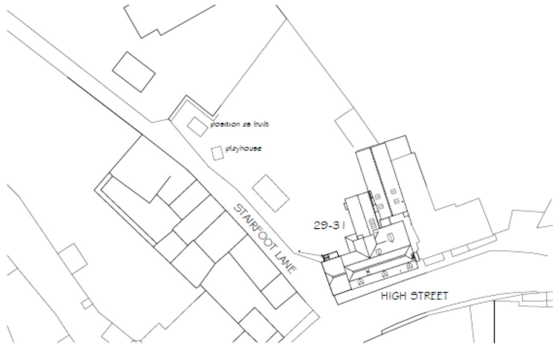
AS BUILT BLOCK PLAN - 1:500