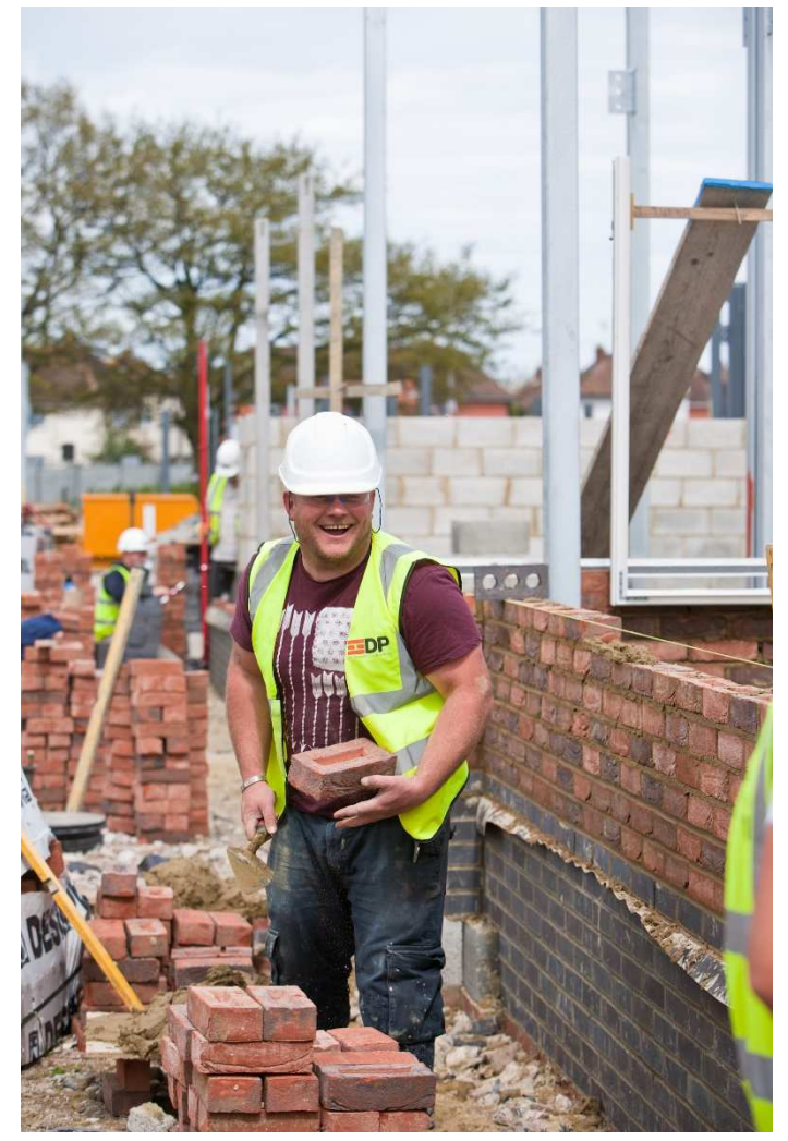
Building of Beeches Extra Care Scheme, Dover