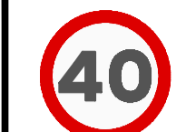
Diagram number 670